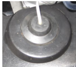
Fuel – level security