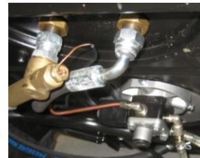
Fuel pump + Max. thermostat